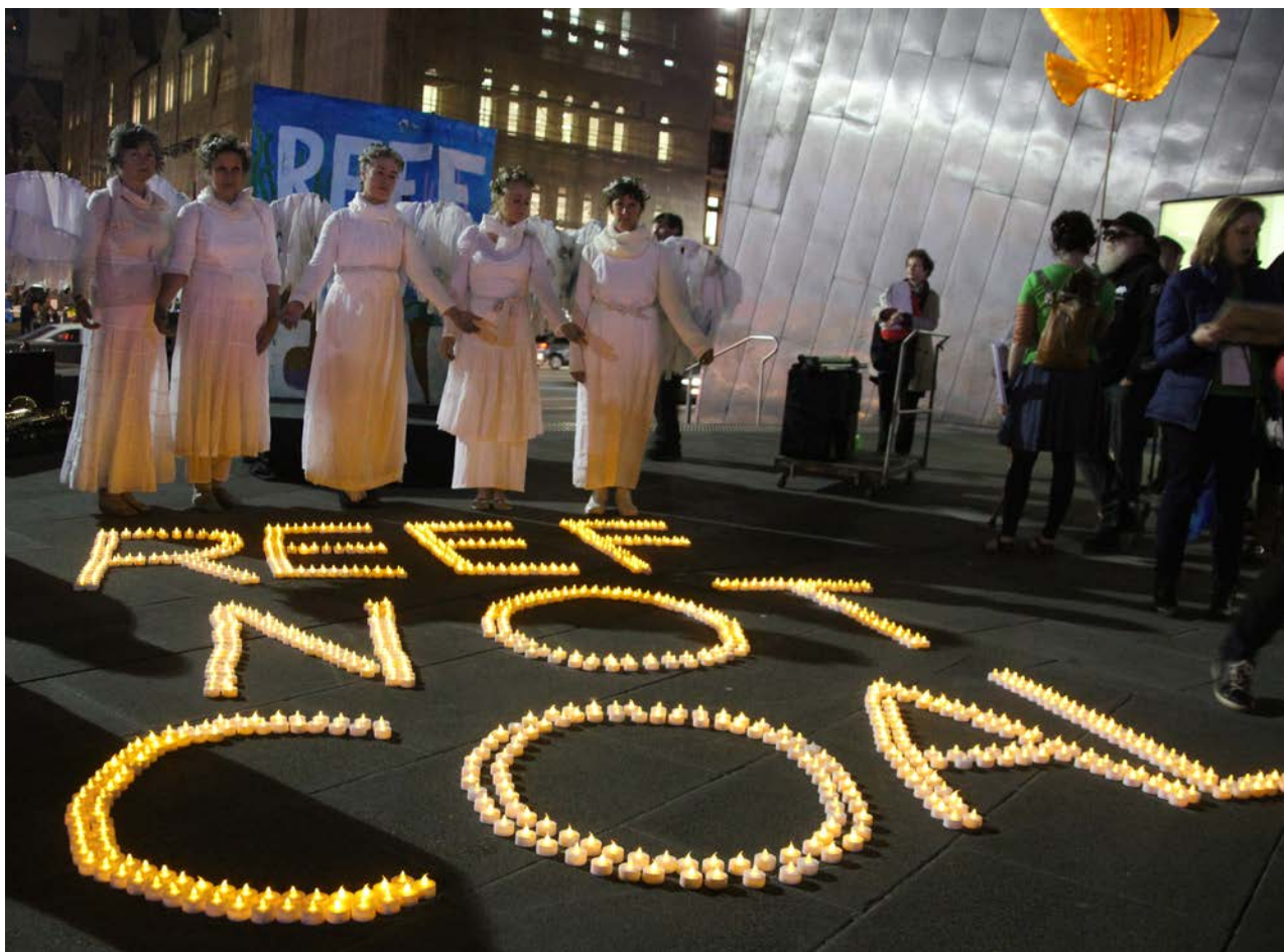
■ A protest in Melbourne against Adani Mining's proposed Carmichael coal mine, 1,749 kilometres away